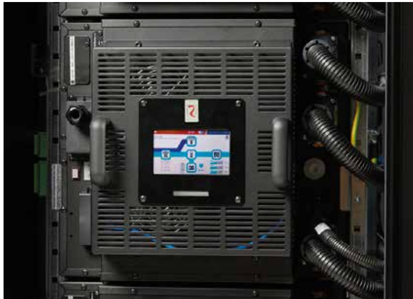
Sentryum Rack Module (Stand alone solution fitted inside a 19" rack cabinet) – Compatible for installation in any 19" enclosure.