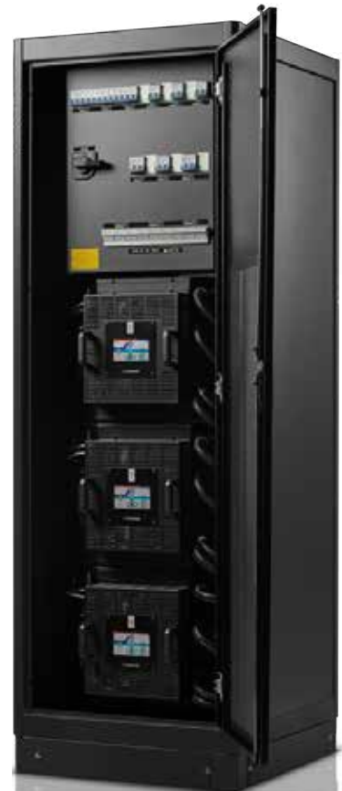
Sentryum Rack Cabinet (Single-phase model).

the end-of-discharge voltage during extended low-load discharges, as recommended by battery manufacturers;